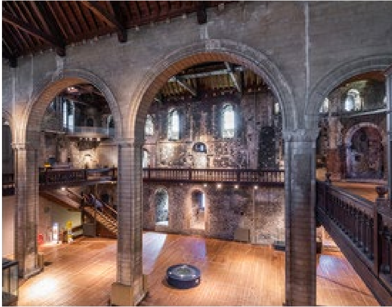
The “Clear View” Keep