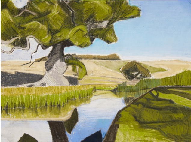
Tor Falcon Sparrow Beck at Felbrigg Pond 2018

Norfolk's rivers and their tributaries are the focus of Falcon's most recent body of work. Over the last four years, Falcon has painstakingly researched and captured her subject, drawing on location within the landscape. The artist describes being captivated by the poeticism of first encountering the rivers as an alphabetical list, with 'names that read like an Old English poem of all things watery and damp.' The result is an exceptional series of drawings that powerfully evokes this unique county. A second hang of Falcon's work opens in October 2019.