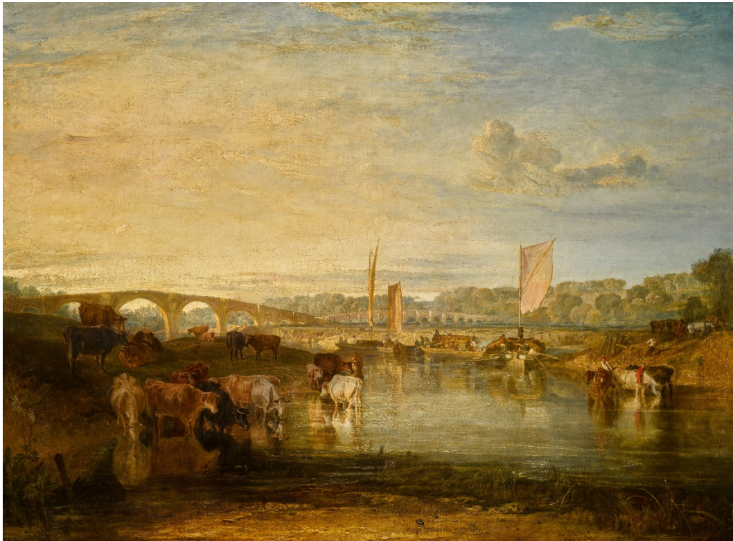
Walton Bridges JMW Turner 1806 oil on canvas

This process, unusually ambitious for a regional museum, has resulted in the successful acquisition of the first Turner oil painting to enter a public collection in Norfolk, Suffolk and Essex. This work, painted in 1806, is ideally suitable for this region. It will complement existing holdings of British landscape paintings by the Norwich School artists, including John Sell Cotman and John Crome, for whom Turner was a seminal influence. His approach, painting directly from nature, was ground-breaking at the time. His example inspired Norwich School artists who also sketched 'en plein air' to immerse themselves in the local landscape.