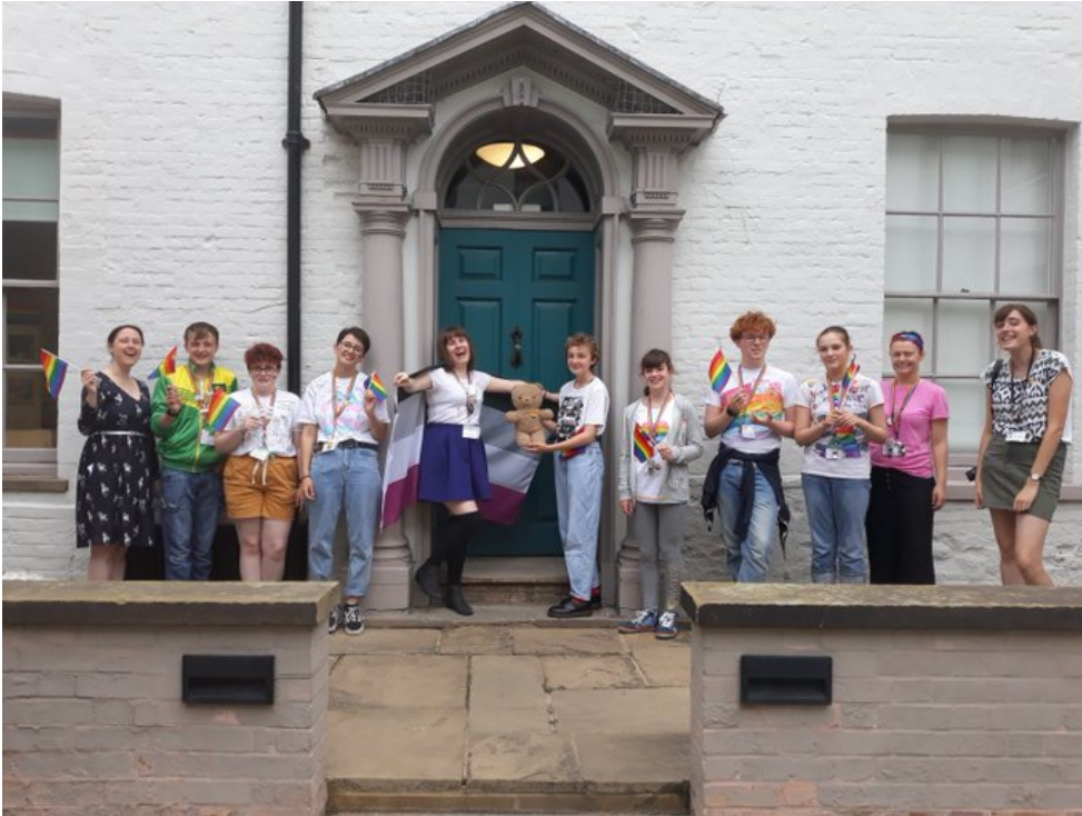
Members of Ancient House Teenage History Club at the Museum of Norwich

Following the capacity crowd tour, the group then took their places in the Pride march.