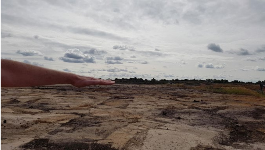
Must Farm

Wilson's work has been commissioned as part of New Geographies , a three-year project which aims to create a new map of the East of England based on unexplored or overlooked places. As part of the project, the public was invited to nominate unexpected places in the region that they found meaningful and interesting. Over 270 sites were identified and ten artists were commissioned to highlight some of those places through new site-specific work. Wilson responds to the nominated site 'View from the North Brink across the Fens' from which Must Farm is visible.