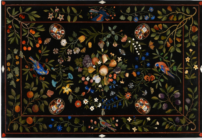
The pietre dure table-top