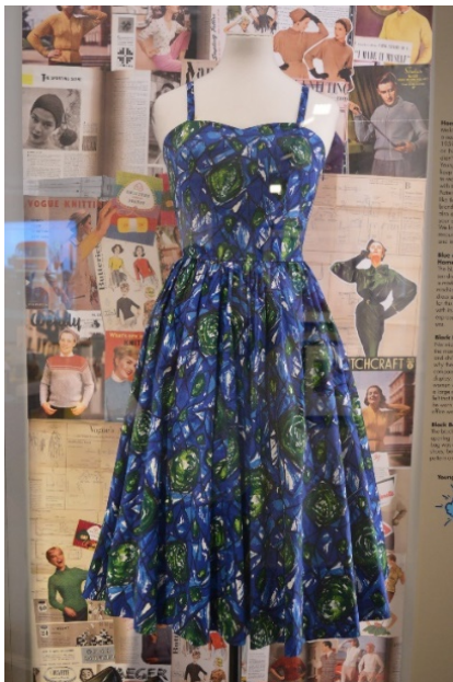
Display case of 1950's costume

The exhibition has also provided a focus for work with young people recruited through the NMS-wide Kick the Dust:Norfolk project. A group of students were recruited and given responsibility to develop one display case of 1950’s costume (shown below) and worked with NMS staff through every step of the curatorial and creative process, including selecting the objects, working on the conservation and final display of the objects and writing exhibition text and designing a graphic drop back. The artistic talents of one of the students in particular earned her three weeks further work experience over the summer holidays, assisting with a programme of drawing workshops.