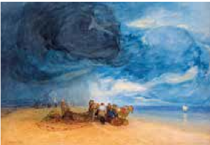
John Sell Cotman, Storm on Yarmouth Beach 1831, watercolour on paper

This exhibition provided a chance for visitors to explore the last two decades of Cotman's life through iconic late watercolours and rarely seen drawings.