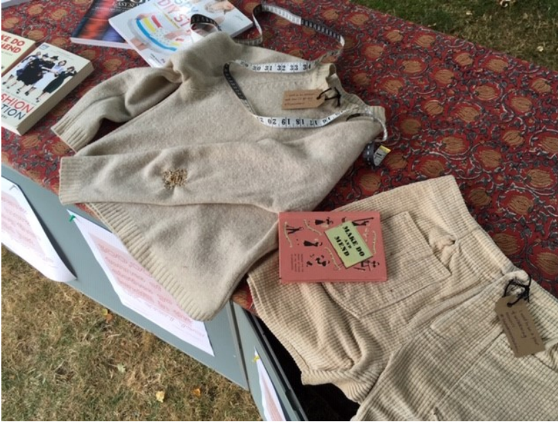
Reinvent, Reuse, Rewear workshop

Collections recently visited by specialist researchers have included the Sarah Glover collection, the Charlie Green photograph album collection, and the textiles collection, including a rare 17 th century beaded basket.