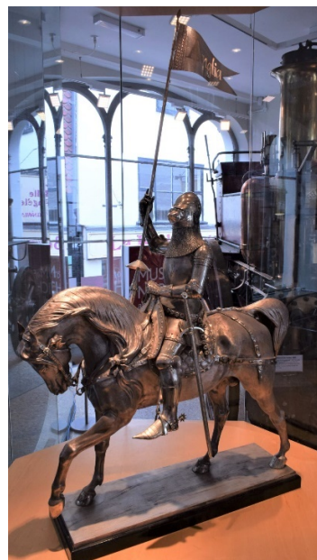
Silver knight, on loan from ITV Anglia