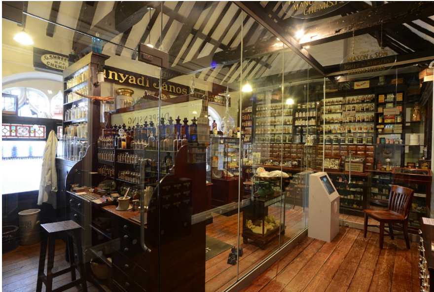
The pharmacy at the Museum of Norwich