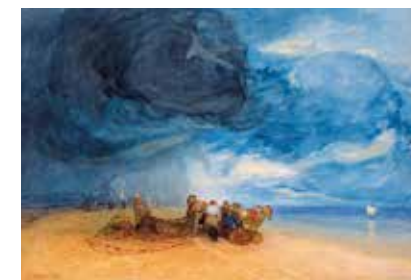
John Sell Cotman, Storm on Yarmouth Beach 1831, watercolour on paper

A chance to explore the last two decades of Cotman's life through iconic late watercolours and rarely seen drawings.