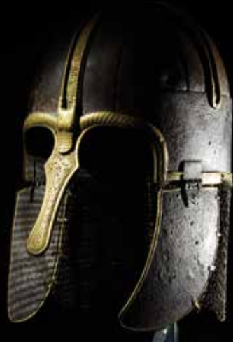
York Helmet