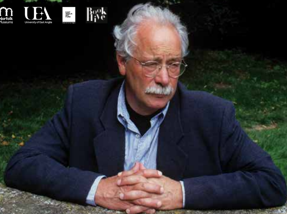
Portrait of W. G. Sebald (1999)